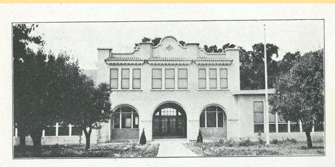
"Our New High School Building"