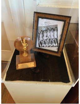
Stephanie Stitch Statler's trophy & picture

There are photographs and memorabilia from school alums, letter sweaters and a majorette's trophy from Stephanie Statler. Wolf Print newspapers will remind visitors about school activities in those years and school annuals (then called El Lobo) are available to leaf through. The sixties are featured with an original Woodstock poster and a classic flowered mini dress. Some school history and photographs have also been plucked from museum archives.